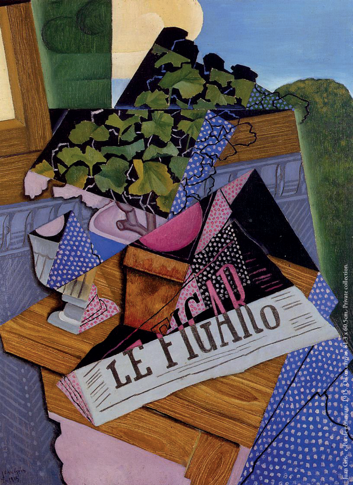
Juan Gris, e-Por-de-géranium, 1915. Oil on canvas, 81,3 x 60,5cm. Private collection.